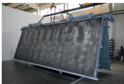
The photo sequence shows the functional principle of the butterfly formwork